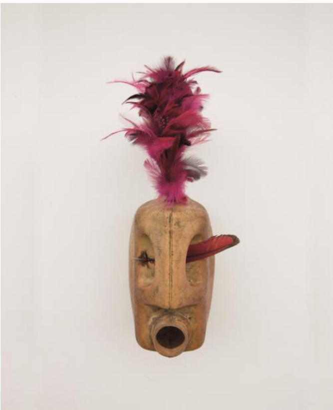
Romuald HAZOUME (Benin) "Chery", 2011 - Plastic and feathers "36 X 12 X 10 cm Fondation Alliances coll.

African artists use salvaged articles of consumption to distort them from their primary function and turn them into original and aesthetic objects. These works appear as a form of resistance to the standardized invasion of their environment.