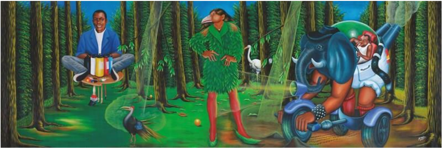
Pierre BODO (Democratic Republic of Congo) - “ The Golden Brush ”, 2007 - Acrylic on canvas and glitter - Fondation Alliances coll.

To represent nature, other artists, in their search for beauty, refer to “ Jannat adn ” a heavenly garden promised to the faithful.