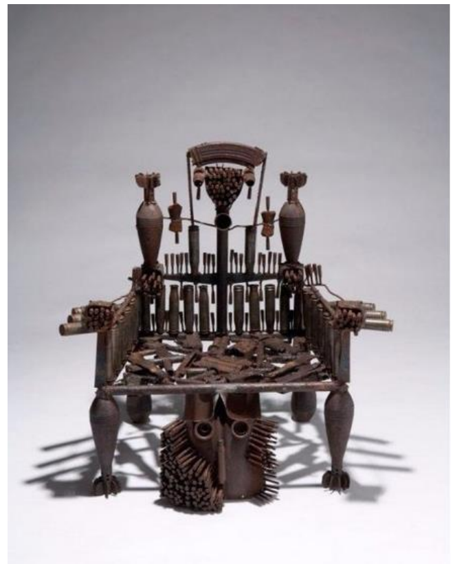
Gonçalo MABUNDA (Mozambique) " War Throne ", 2013 Recycled metal and weapons, 91x 92 x71 cm CAAC Coll.- The Pigozzi Collection, Geneva